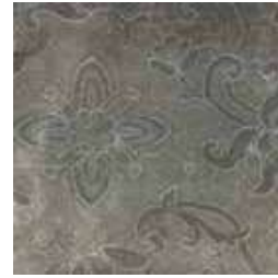
MTX Deco 24x24

Sold in sets of 4 random PCS 6 Patterns Available