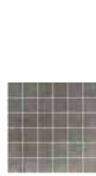
2x2 Mosaic on 12x12 Available in all colors